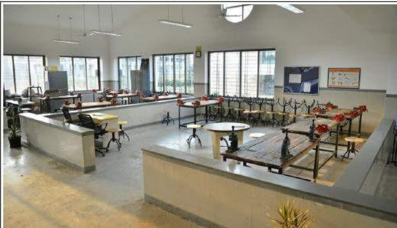
Workshop (Fitting Shop)