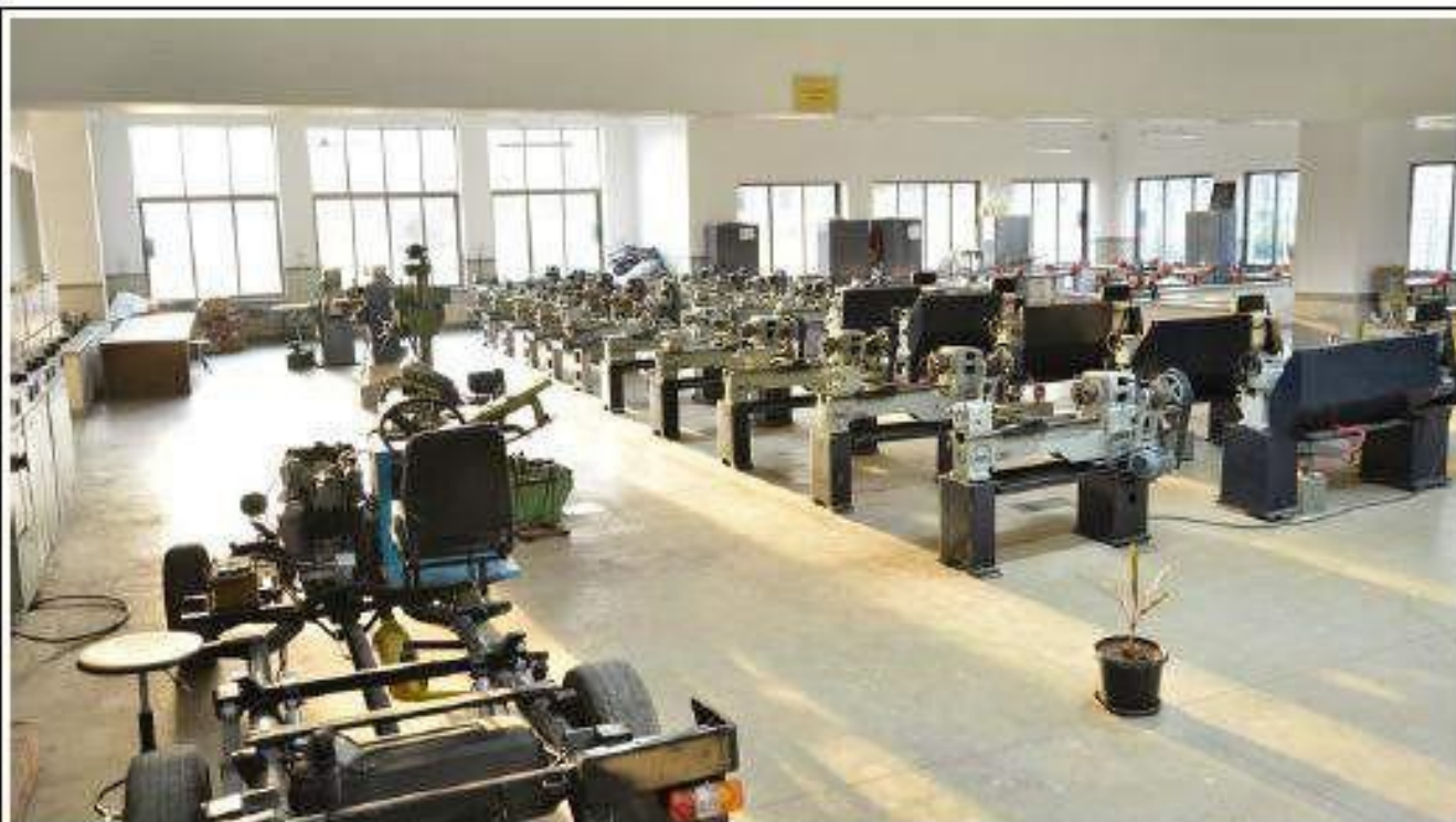
Workshop (Machine Shop)