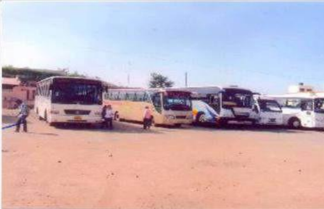
TRANSEPORT FACILITY FOR STUDENTS