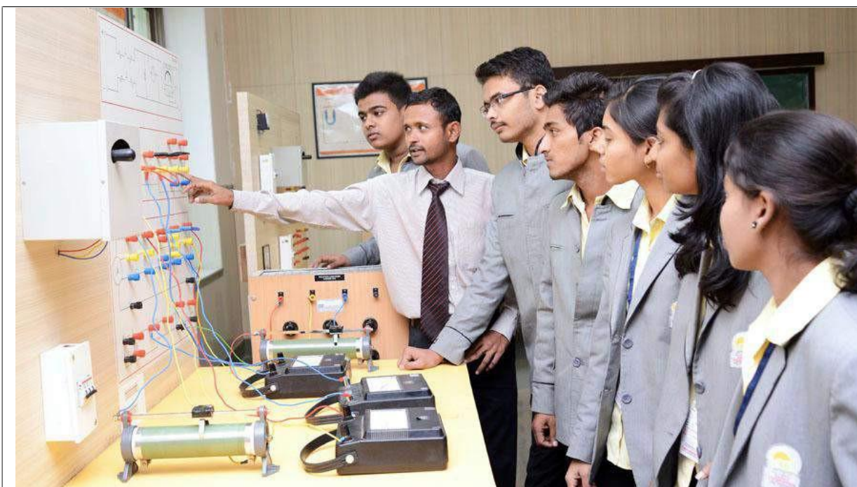
Electrical Machine Lab1