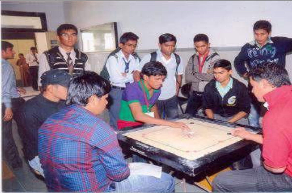
INDOOR GAMES FACILITY