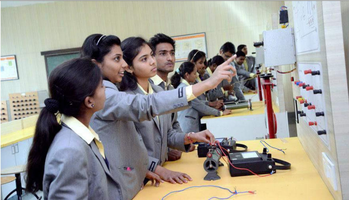
Electrical Machine Lab