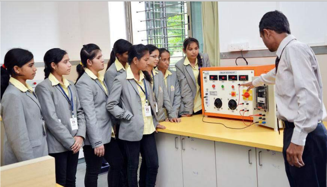
Power System Lab