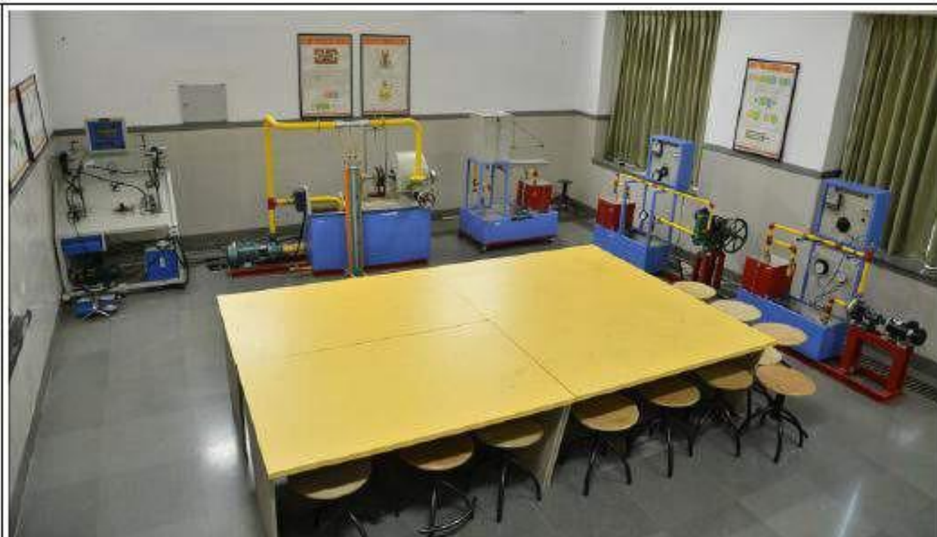
Fluid Power Lab