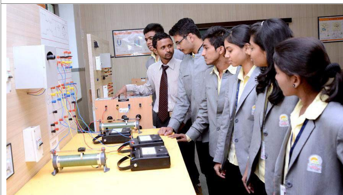
Electrical Machine Lab2