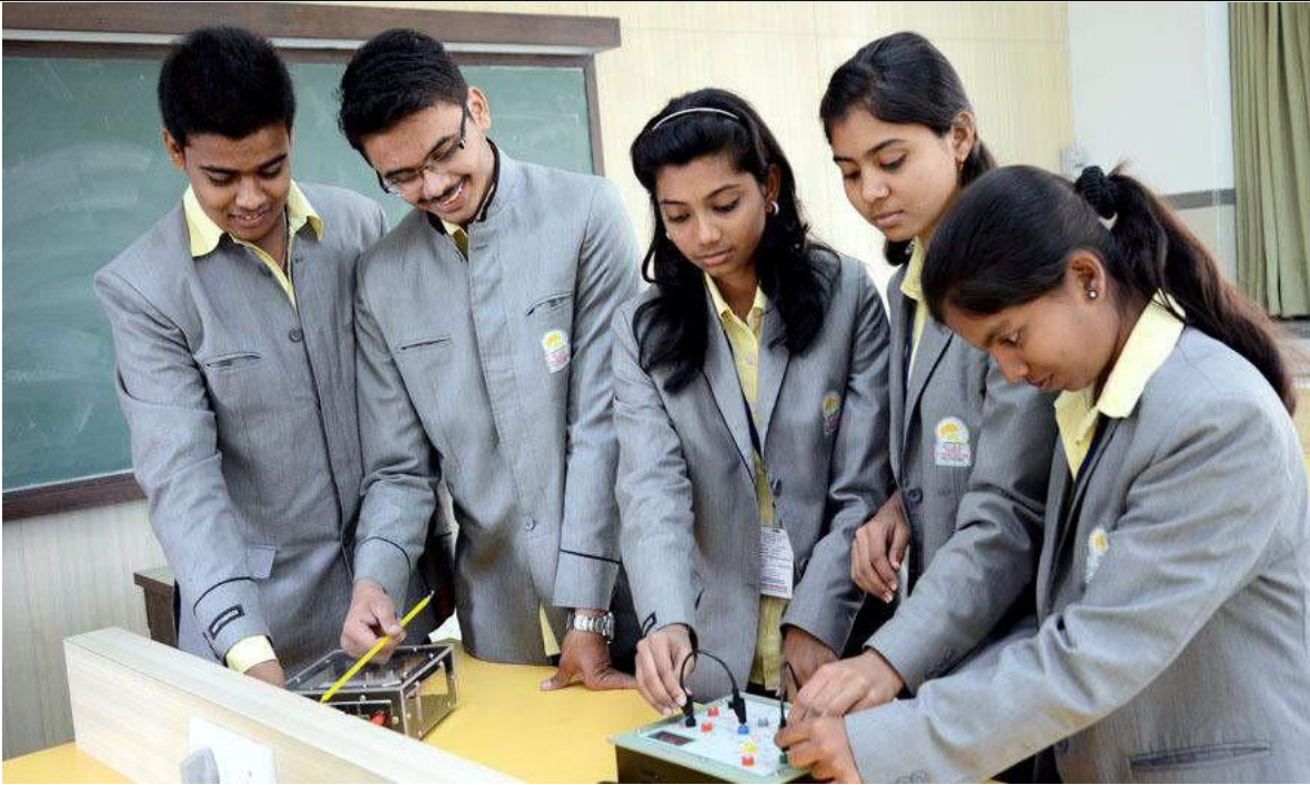
Electrical Measurement Lab