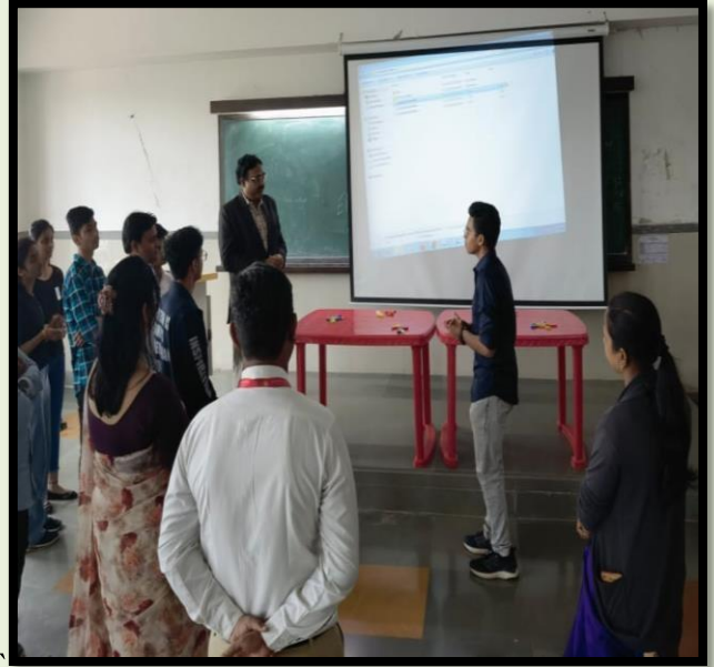
Activity: Out of the Box