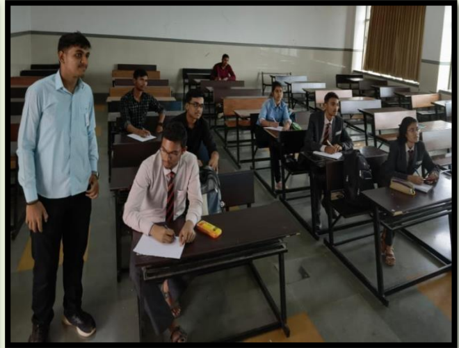
Activity: Code Dry Run