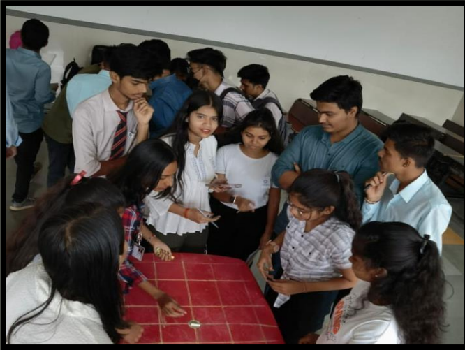
Activity: TIC TAC TOE