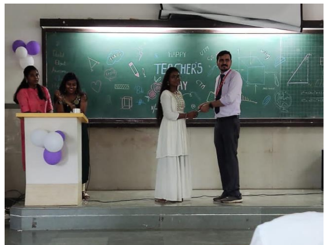
FELICITATION OF STAFF MEMBERS BY STUDENTS