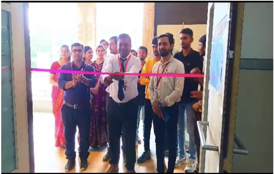
INAUGURATION BY HOD & STAFF MEMBERS