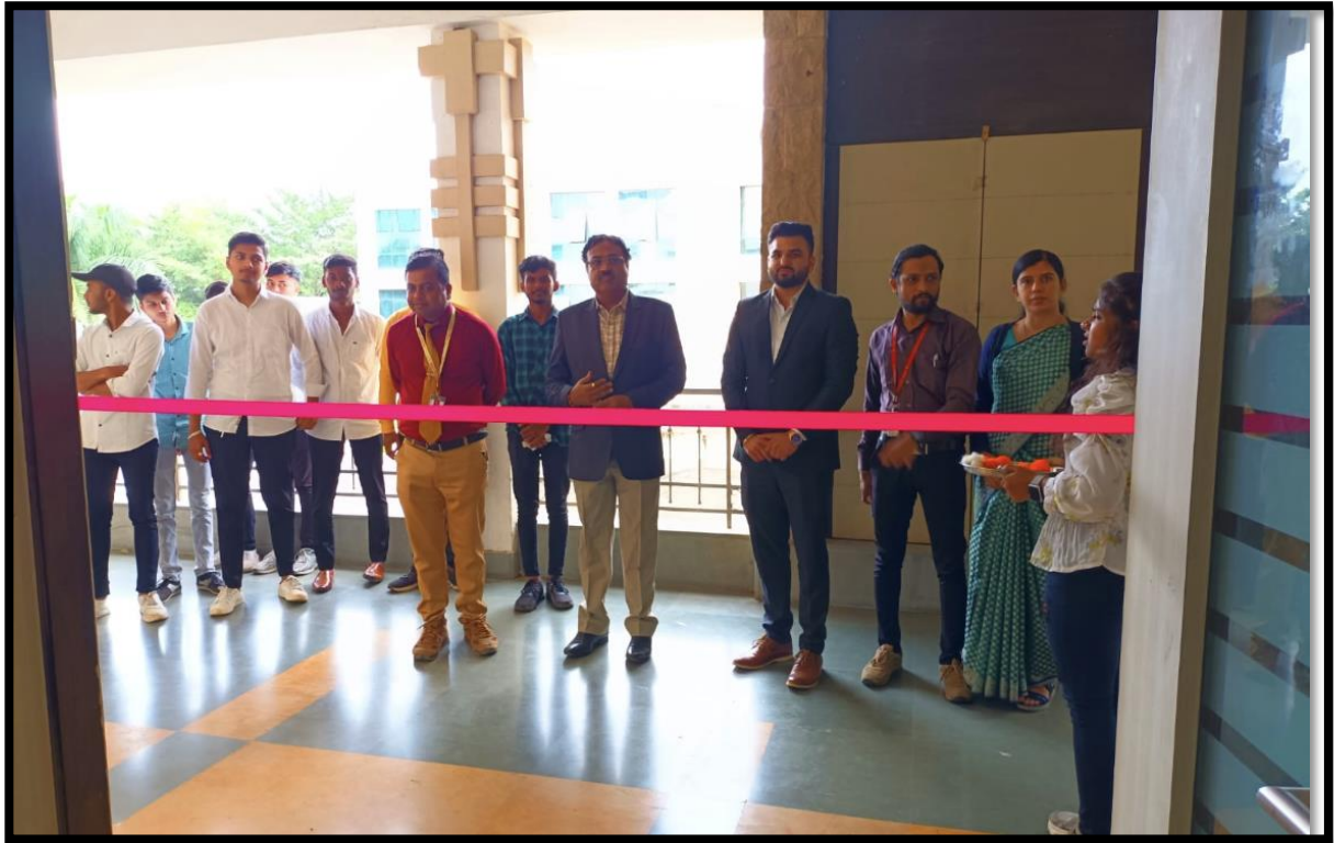
Inauguration by Chief guest and Faculty members