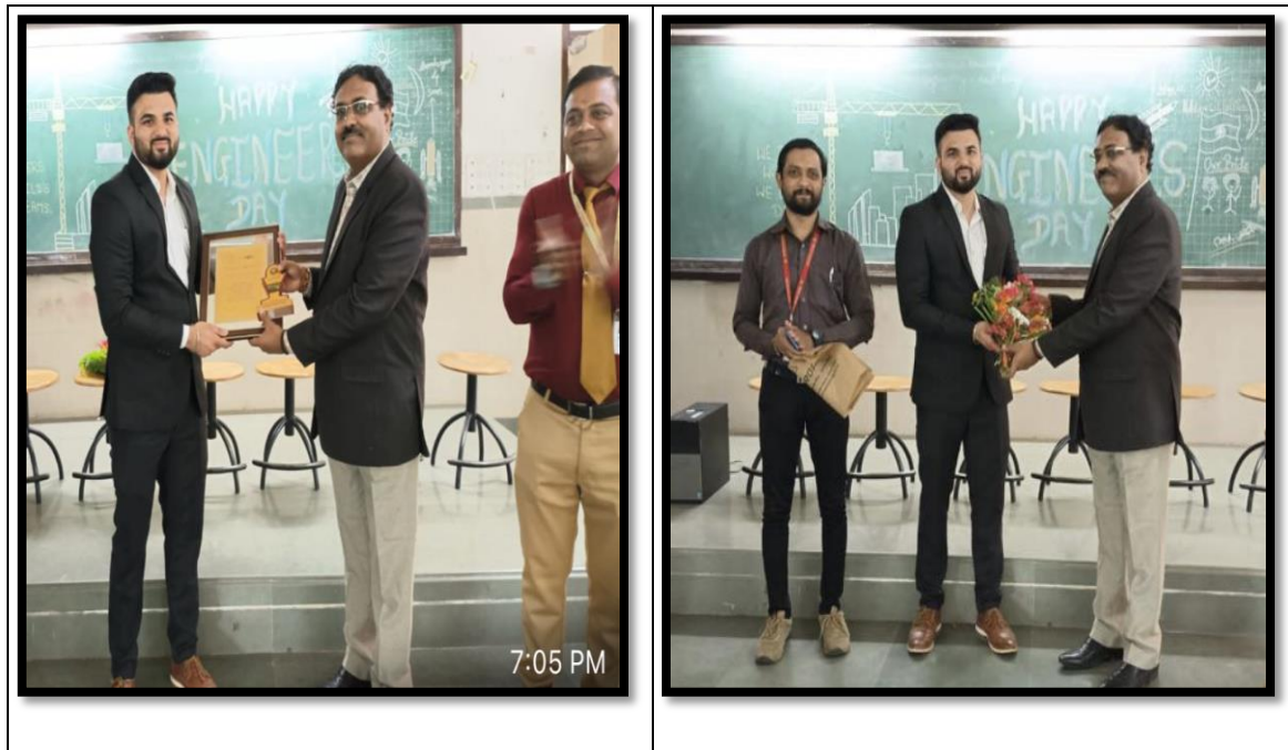
Felicitation of Chief guest by Principal sir