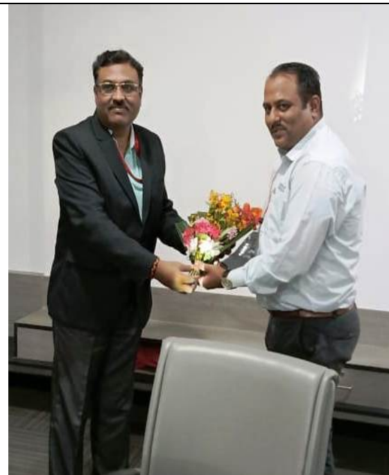
Principal Sir Welcoming HR Team Member of Rucha Engineering, Nashik.