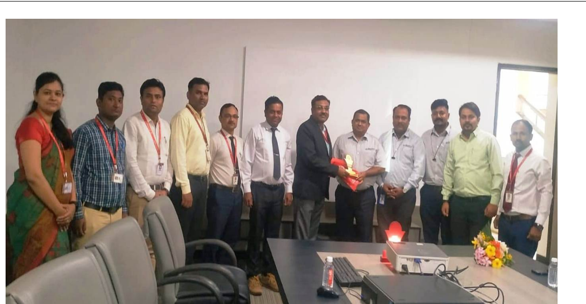
Placement Drive in association with Rucha Engineering 2.0., Nashik