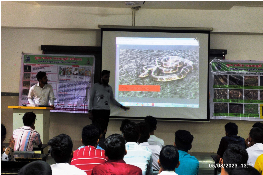
II nd Venomous Snake is Common Krait Snake