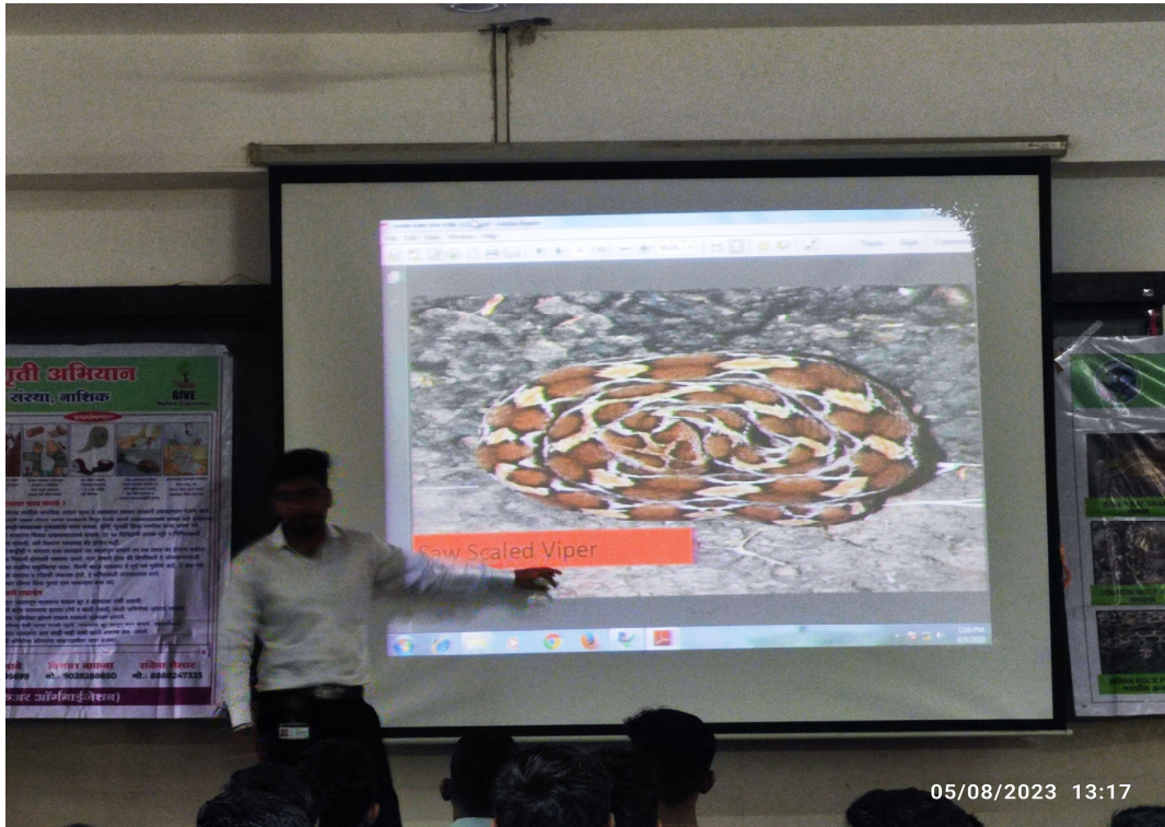
IVth Venomous Snake is Saw Scaled Viper