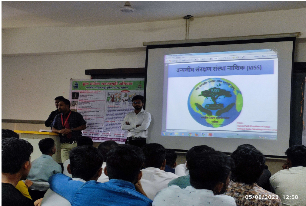
Inauguration of Expert Talk “Environment Awareness – Zero Snake Bite Awareness Campaign”