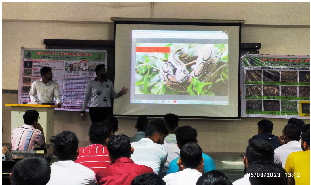
III rd Venomous Snake is Russell Viper