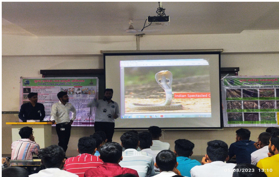
Ist Venomous Snake is Indian Spectacled Cobra