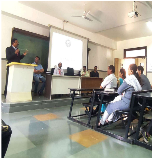
Speech by Principal sir