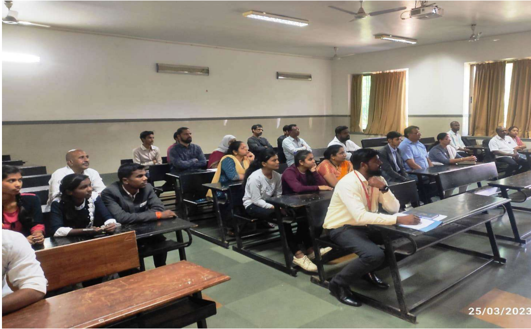
Present Parents for Meet 2023