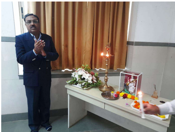
Saraswati Pujan By Principal Sir