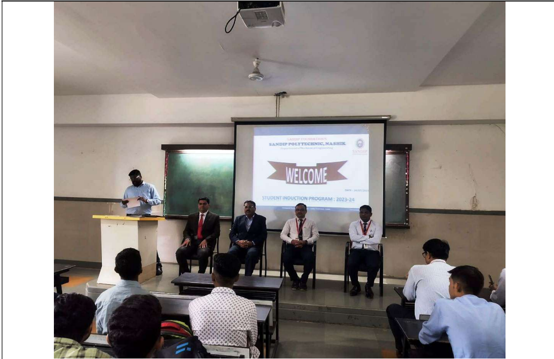
Inauguration of Induction Program