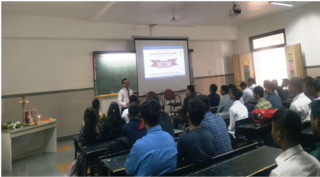
Session of Orientation of Mechanical Program