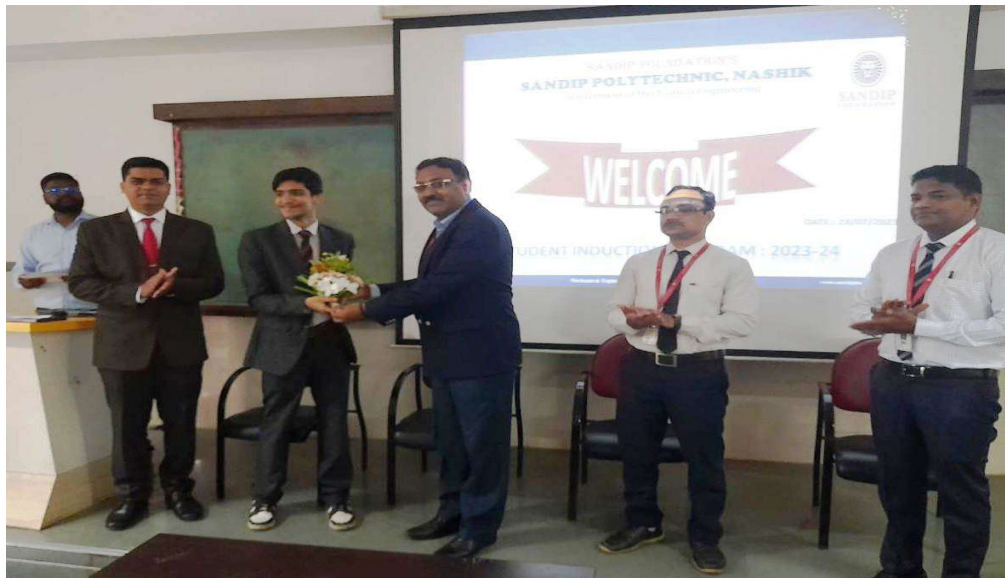
Felicitation of Toppers