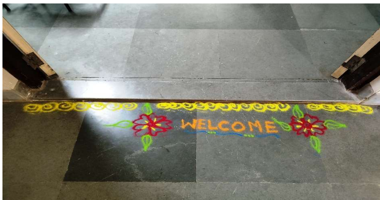
Welcome Rangoli For Engineer's Day