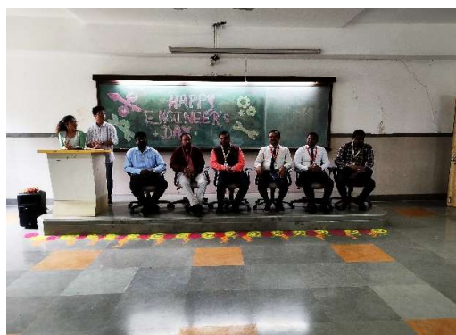
Welcome Speech By Student