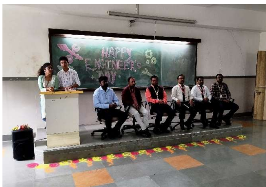
Engineer's Day Function Inauguration