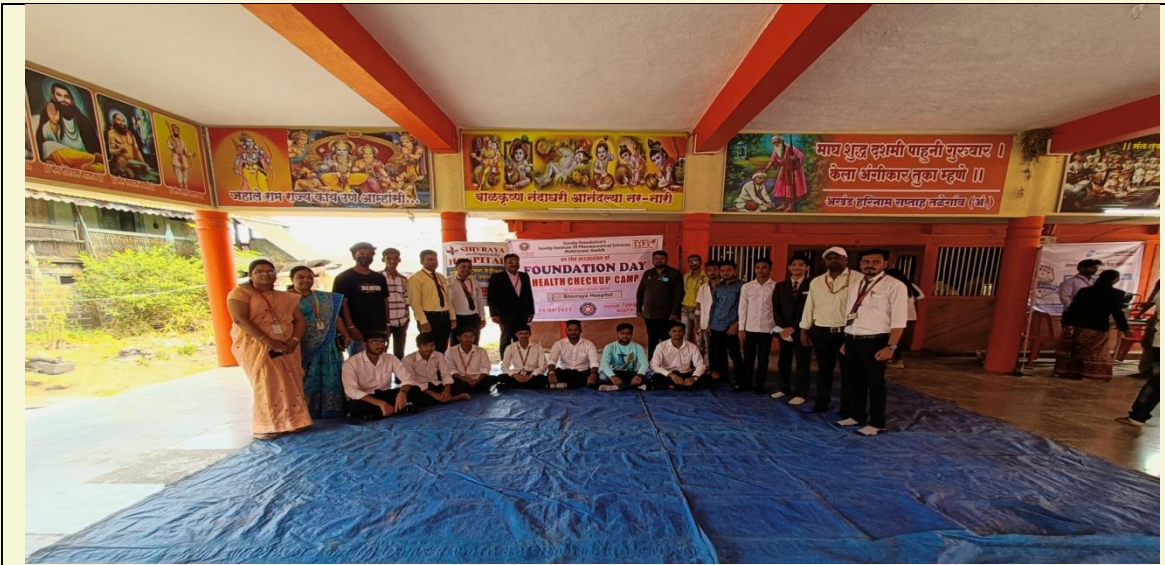
Health Check Up Camp