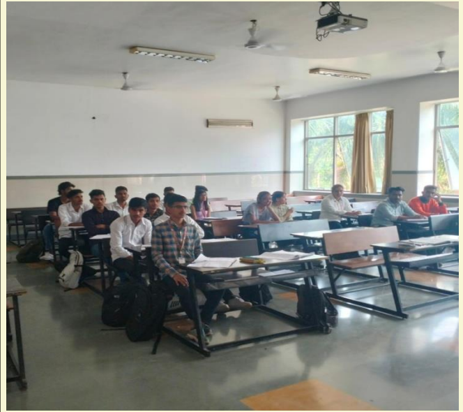
Students present for an Expert Lecture