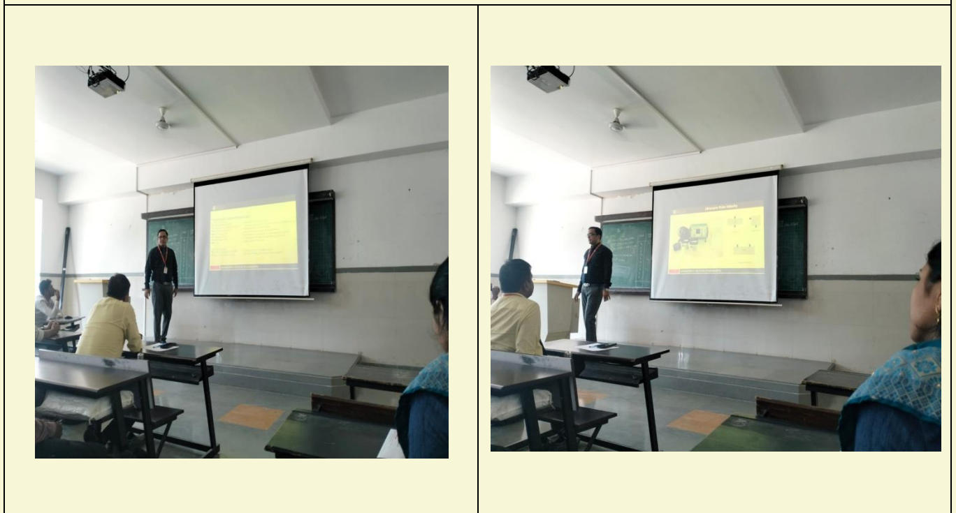
Explaining Test To Be Conducted For Structural Auditing.